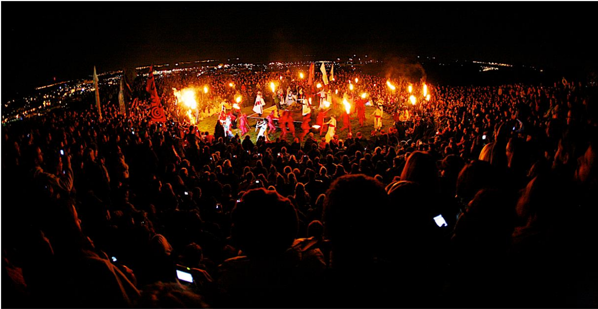
Figure 1 Beltane Fire Festival performance