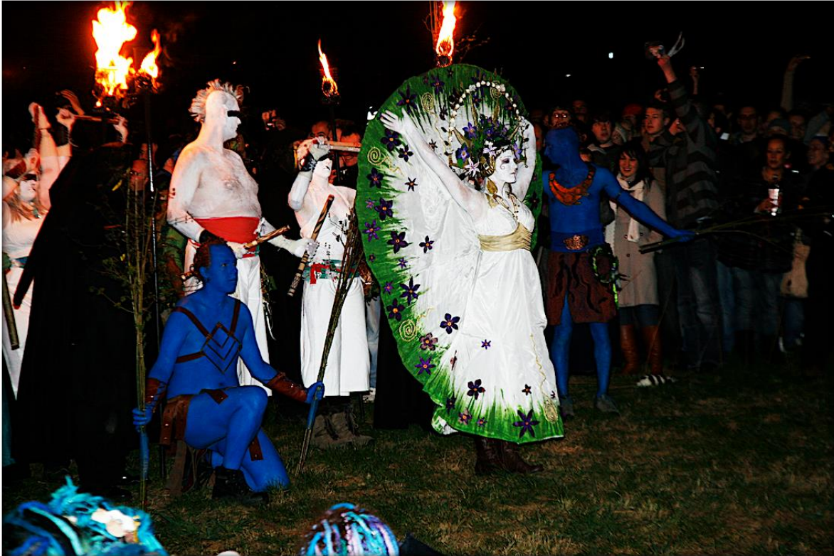
Figure 2 The May Queen