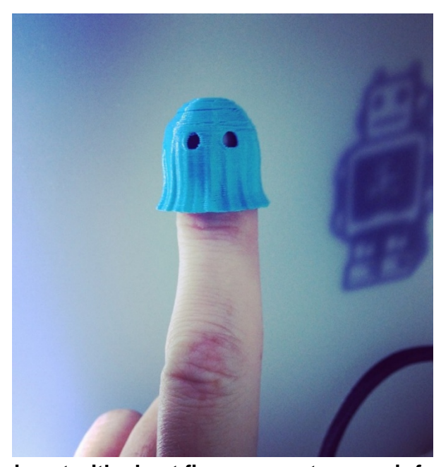
Figure 3: Experiment with ghost finger puppet souvenir from Thingiverse