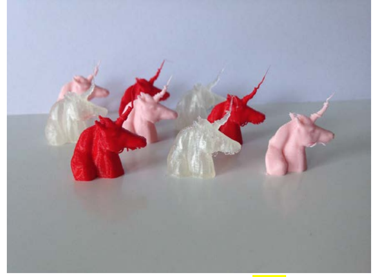
Figure 7: Small 1.5cm tall unicorn head souvenirs

A list of six questions were developed based on themes taken from the initial literature review that were then reworded to reflect the pilot study feedback. The questions sought to identify the participants' previous knowledge and exposure to 3D printers; their impressions of the printed souvenirs, their willingness to pay and interest in souvenir personalisation through 3D printing. To make the connection to the visited site more explicit, they were also asked to identify any items that had seen during their visit that they wished to personalise as a souvenir. The participants could not be identified by the personal data they provided (gender, age group and nationality) and could refuse to participate.