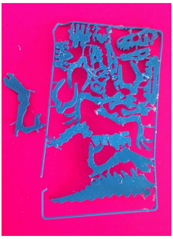
Figure 4: Experiment with buildable dragon design from Thingiverse

A pilot study (n=16) took place on site to test the interview questions, confirm the feasibility of collecting data on site and to help determine the best location within the castle to collect information. After the pilot study trials, the 3D printer was moved from the gift shop where it had been originally placed and where there was limited available space to the main Hall, which visitors accessed as they toured the site.