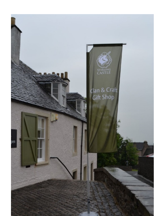
Figure 5: Stirling Castle gift shop showing Historic Scotland's branded flag

eighteen were not interviewed and there were a limited number of photos taken to protect the privacy of families with young children that were visiting the castle during data collection. The researchers had adapted the research design and methods prior to carrying out the data collection to address such research integrity issues. In addition, all the visitors who participated in the pilot and the main study signed a consent form, which detailed the purpose of the project and how the information they provided was processed, used and stored.