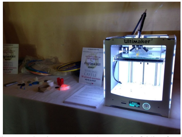
Figure 6: 3D printer and samples set up in Stirling Castle