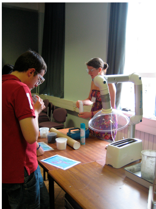
Figure 1. Students learn about aerosols in the atmosphere.

were between 30 and 40, and there were usually between 5 and 6 different activities, depending on the number of students. An example of one of these activities is shown in Figure 1.