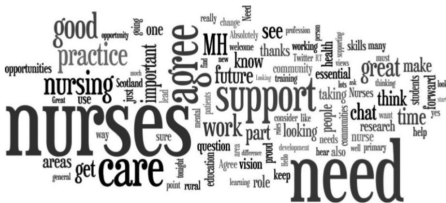
FIGURE 2 Word Cloud of the top 100 words used during the Twitter chat #CNOScot

new interventions translating into clinical practice (Kitson, 2004). Research exploring the extent of this issue and staff and settings most in need of a research culture, could help pinpoint where resources need to be invested which would inform future nursing strategies and help to advance this global agenda. As suggested during the Twitter chat stronger links could be forged between the health service, higher education and research centres with specialist expertise to help deliver this.