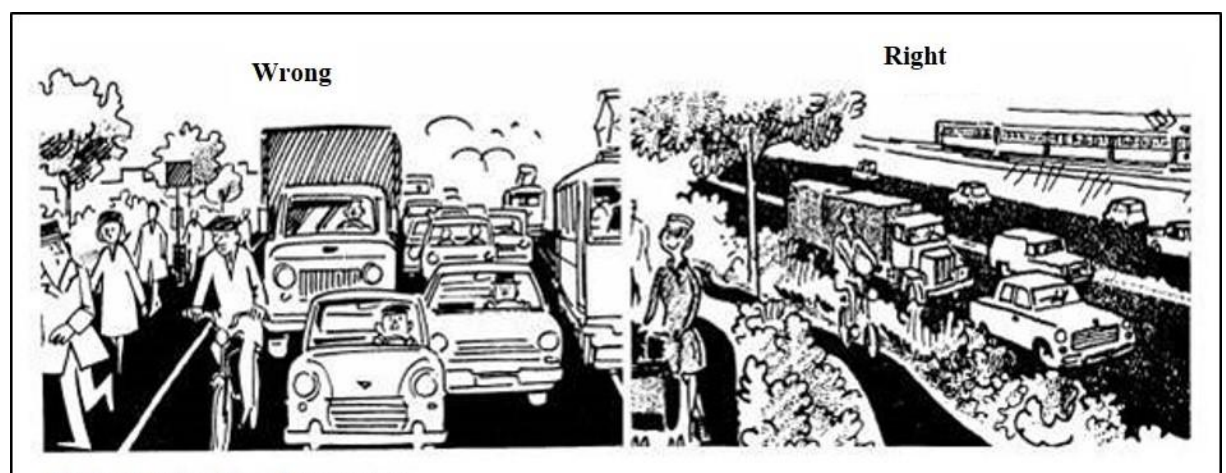
Figure 1: Principles of Separation