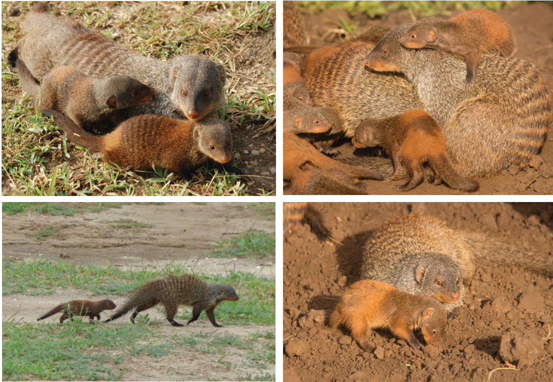
Figure 1. Escorts care for the pups carrying, feeding and grooming them.

data and set of predictor variables included in each analysis, see details below and electronic supplementary material, tables S1–S3.