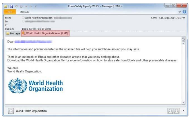
We should know by now - donŌt click that link.

A chain is only as strong as its weakest link. Computer security relies on a great number of links, hardware, software and something else altogether: you. The greatest threat to information security is actually people. Why strive to defeat encrypted passwords stored in computers, when those computers' human users will turn them over willingly?