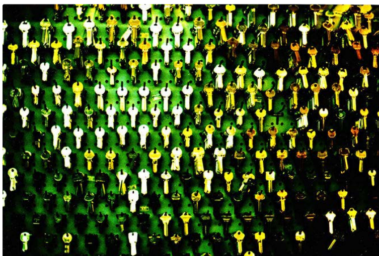
Who's looking after your keys?