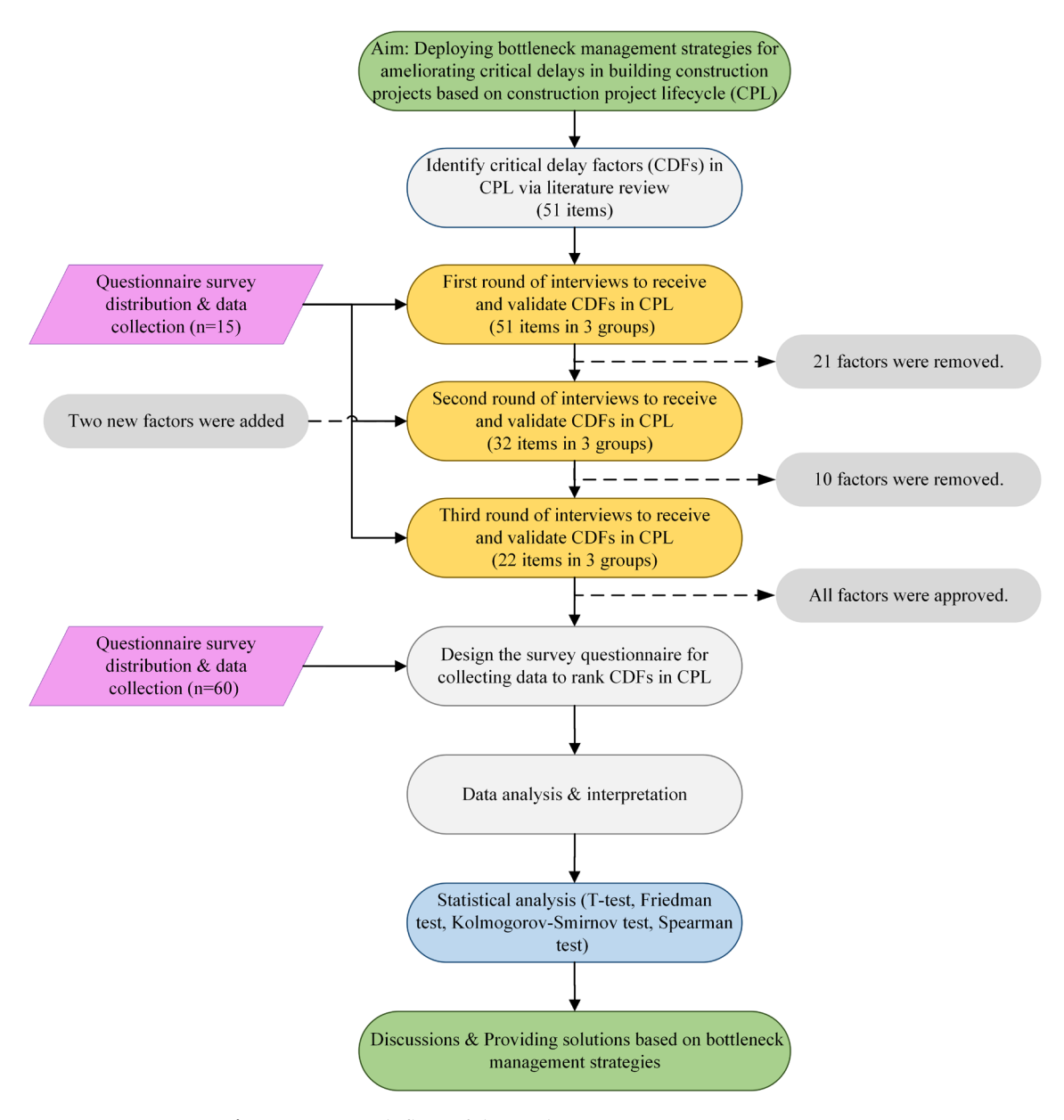
Figure 1. Research flow of the study.

The processes for assessing the questionnaires were as follows: (i) Identifying CDFs in the CPL and categorizing them based on the time of occurrence of the CDF in the first phase. The process of brainstorming was utilized. Respondents based their opinions on the criticality or not of the factors in three separate stages— this was carried out using a semi-structured questionnaire (open end)—which included 51 factors in three different groups. (ii) A questionnaire was distributed among the respondents in the second phase to analyze the impact and probability of CDFs in the CPL in developing countries, using Iran as a case example. (iii) In the final phase, based on the results of the second phase, blueprints were suggested on how to reduce the impact of delays in the CPL and how to use bottleneck management in the CPL to move the project forward discussed. Figure 1 shows the main steps of this research.