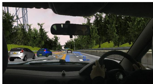
Fig. 1 Screenshot of AR HUD collision avoidance route suggestions by AI Co-driver [18]

The use of multimodal HMI ensures the conveyance of information to the user in cases where an overload of stimuli could hinder human cognition and delay the decision-making process [5]. To enhance the provision of information to the user a guidance system is typically designed to provide a step-by-step instruction in various forms of audio, visual and tactile feedback. This has been utilised in numerous fields and applications to ensure the timely and efficient information and/or knowledge transfer [13,14]. The employment of gamification further improves this process and reduces the users' anxiety [15,16].