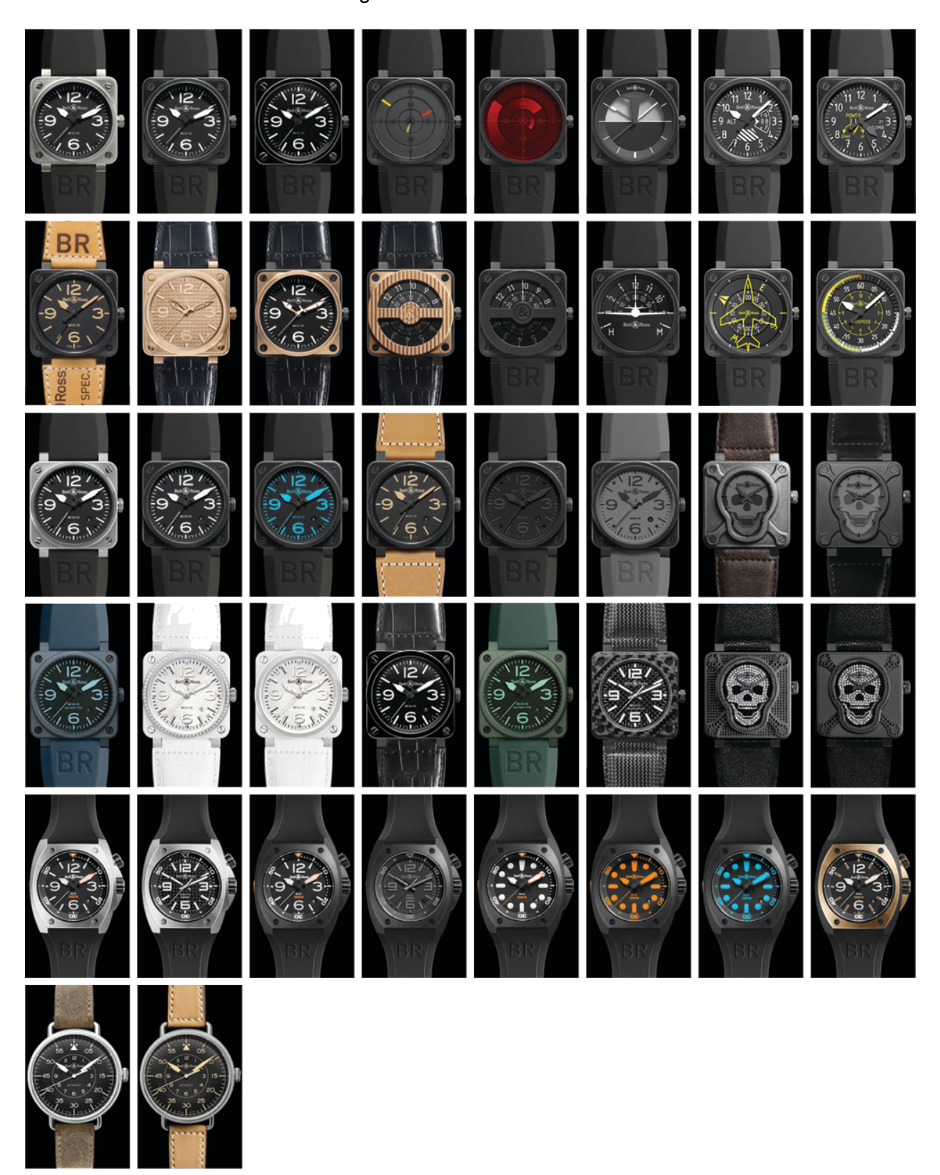
Figure 2. 42 Bell & Ross watches using the ETA 2892A2 movement.

simplistically, the movement can be 'dropped in' to the watch case. This in turn allows brands to create small production runs of watches whose internal configuration, parts and assembly are identical. The power of a system in which multiple designs can be created using the same internal movement is illustrated in Figure 2.