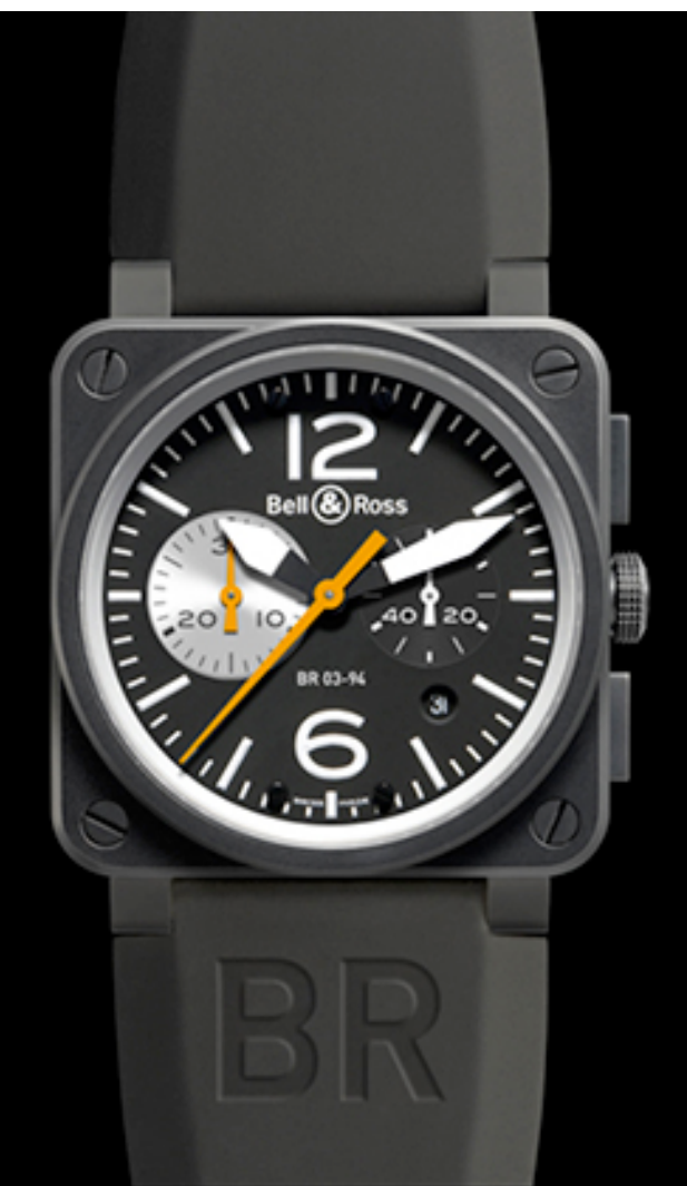
Figure 1. The Ulysse Nardin Maxi Marine Chronograph and the Bell & Ross BR03-94 share the same ETA 2894 movement.

The ebauche tradition is therefore an instrumental part of the production of artificial rarity, in that it allows the continuation of small, distinct brands which would otherwise be unable to manufacture highly sophisticated movements (Baker, 2000). However, it also plays a further role in the perception of exclusivity, in that it provides brands with platforms on which to create many variants of the same product. The supply of movements by an OEM demands that brands incorporate a modular (rather than integrated) architecture within their designs, one in which,