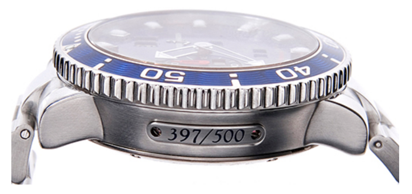
Figure 3. The Ulysse Nardin Acqua Perpetual Limited Edition, number 397 of 500 pieces.

In parallel to the strategy of small production runs, the Swiss watch industry also uses limited editions to artificially induce exclusivity. Limited editions may incorporate a new design, such as the Ulysse Nardin Tellurium J. Kepler , limited to 99 pieces, but are more typically variants of standard designs, incorporating new material or colour combinations such as the Ulysse Nardin Acqua Perpetual , limited to 500 pieces (Figure 3). In both cases, production is limited to a predetermined number of pieces even if customer demand suggests that more units should be manufactured. This not only generates publicity (brands will often announce limited editions at major trade fairs such as Baselworld), it also ensures a second-hand market amongst collectors in which prices are kept high, further adding to the reputation of the brand.