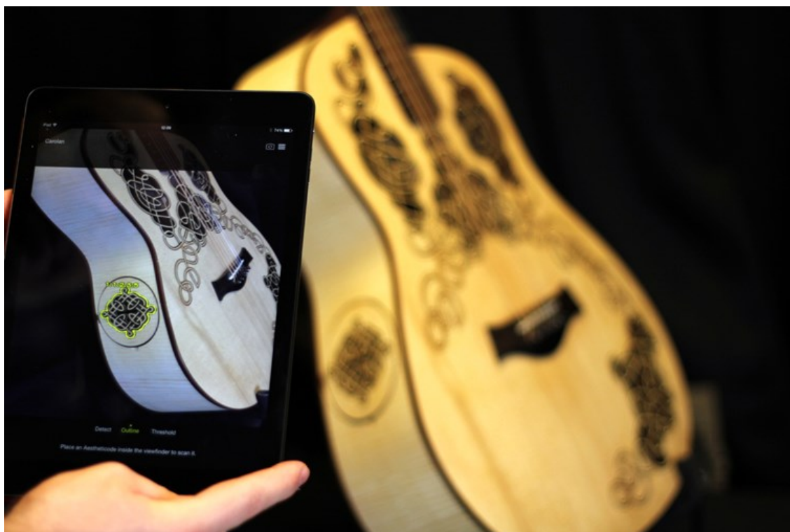
Figure 4: Scanning the Carolan's soundhole

a mobile device to conjure up digital information, in this case media from our guitar's digital record. We then collaborated with a professional luthier (instrument maker) to design and hand-build a bespoke acoustic guitar, including inlaying these six designs into different parts of its body – the headstock, fretboard, front soundboard, back, top and in a small nook at the cutaway – as shown in Figure 4.