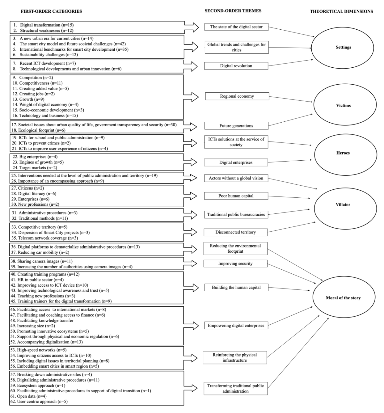
Figure 1 - Data structure (n = number of coded passages)