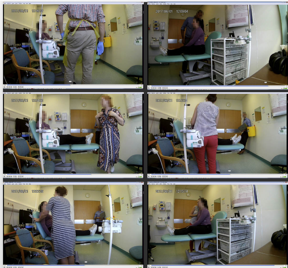
Figure 1. Example of mock procedure footage from one of two camera angles.

A common method used to collect behavioural data in health care is direct observation [9–14]. Other methods include reported behaviours [15], videography [16,17] and radiofrequency ID sensors [18,19]. A traditional limitation of direct observation in behavioural studies of hand hygiene or other types of behaviour by HCWs has been the Hawthorne effect, which recognizes the change in behaviour of subjects due to being observed [20,21]. While the Hawthorne effect may also affect videography, this type of observation may be less prone to bias compared with direct observation [22,23]. However, there are other concerns related to videography, such as risk of identification and the possibility of multiple or unauthorized people accessing the footage. This may complicate ethical approval when using videographic methods in health care, where patient data must be protected and doctors fear liability [23]. However, as videographic footage can be viewed by many people, this methodology results in more