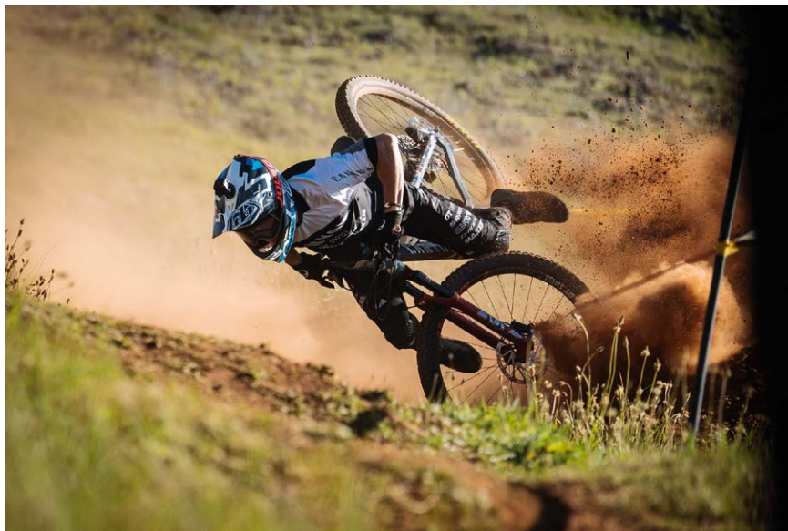
► Fig. 2 Injuries occurred most frequently on steep, dirt/rocky stages.

race injury incidence in the present study was similar to the 43/1000 hours reported in downhill racing in the US [14] and higher than the 20/1000 hours reported in downhill riders from Germany, Luxembourg, Switzerland and Austria [17]. The rate of injury was also higher compared to that reported previously in cross-country mountain bike racing (4.0/1000 hours racing) [8].