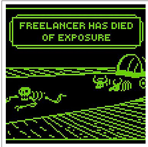
Figure 3. Exposure meme.

Source: Idea by Michelle Nickolaisen, design by Martin Whitmore.