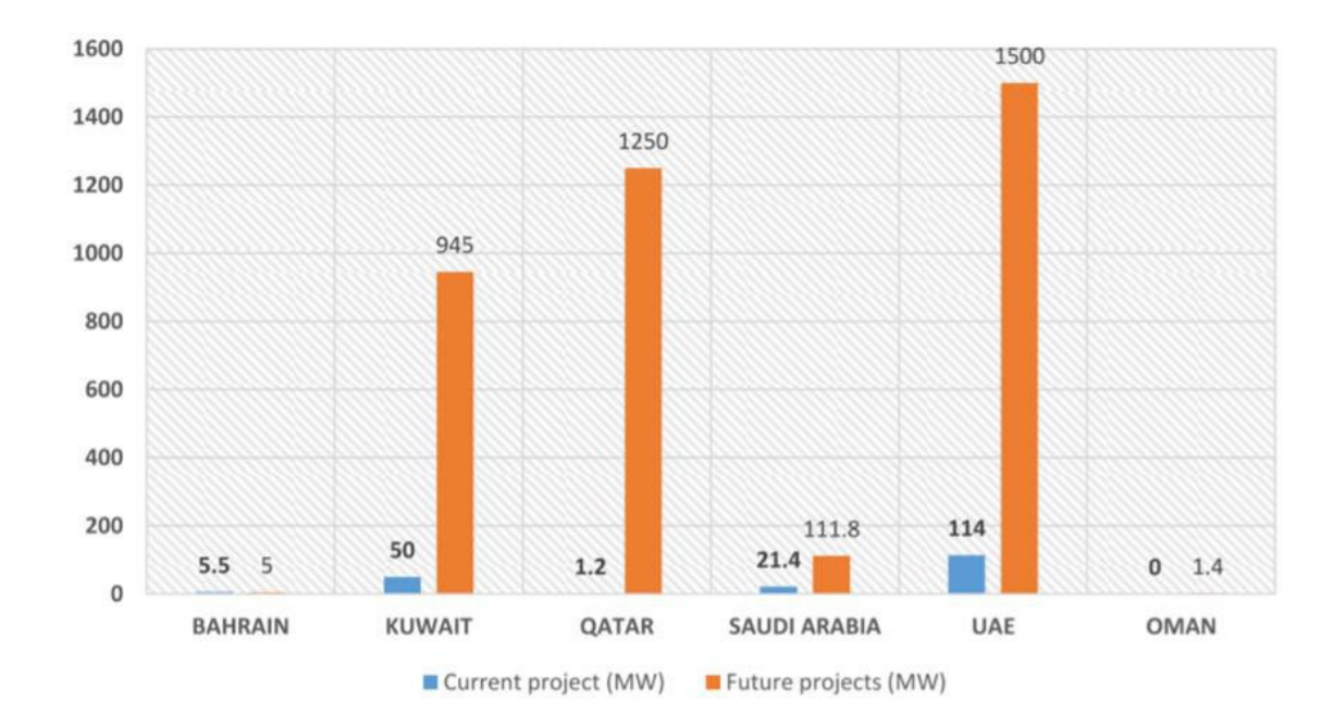
Figure 1. Current and Future solar projects in the GCC countries [( (N.W. Alnaser, 2019)].

Solar energy installations have seen rapid growth since the past two years in GCC countries. Figure 1. shows the current and future planned solar projects in the pipeline to be deployed in the GCC countries (N.W. Alnaser, 2019). In Oman, the current PV solar installation capacity has reached to 1.4MW and with future planned capacity of 100MW (News, 2018). UAE has stood in forefront with highest installations capacity (114MW) among the GCC countries. The near completion of 1.2GW (Noor Abu Dhabi) single solar site project and recent tender release of further 2GW project show the commitment towards sustainable energy (parnell, 2019). It is believed that this could be largest solar project to be built in the GCC member countries. However, Saudi Arabia has recently signed a memorandum of understanding (MoU) to construct 2.6GW solar project at the mecca region (Martin, 2019). Although the solar industry has seen a rising trend in some GCC countries, similar pace seems to be absent in Bahrain and Oman as discussed in the challenges section below.