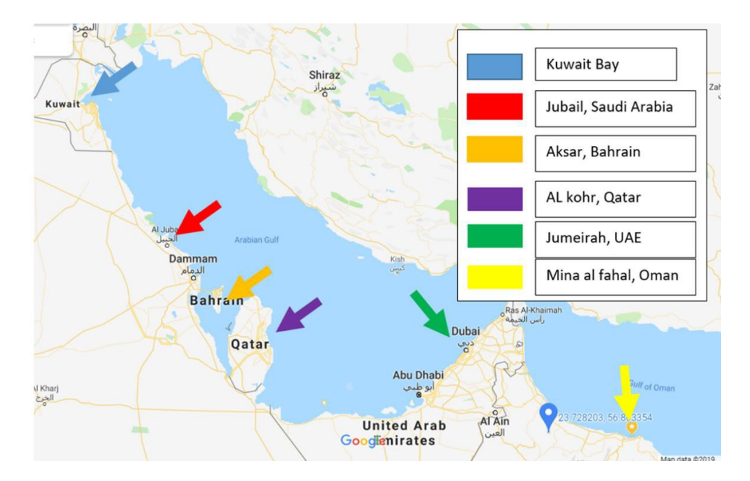
Figure 3. The potential sea regions in the Arabian gulf for deploying Floating PV systems.

The sea surface temperatures of the proposed six offshore regions are displayed in Figure 4. The primary axis shows the temperature in <sup>o</sup>C and the blue bars shows the respective temperatures for each region. The source for acquiring this data is from National Oceanic and Atmospheric Administration of the United States (noaa.gov, 2019). The SST of the potential regions is lower by at least 10<sup>o</sup>C to 15<sup>o</sup>C comparatively with the land temperatures. The lower sea surface temperatures help the PV panel to maintain the reduced operating temperatures, thus increasing the efficiency. The report (Bhattacharjee, 2018) claims that the plants operating in floating form have higher efficiencies in the range of 5-16% compared to land-based PV plants The evaporation mechanism helps in decreasing soiling and dust formation. Figure 3 shows the potential regions in the GCC to deploy the floating PV systems. The study and analysis of potential electricity generation in these areas will be presented in a full research paper.