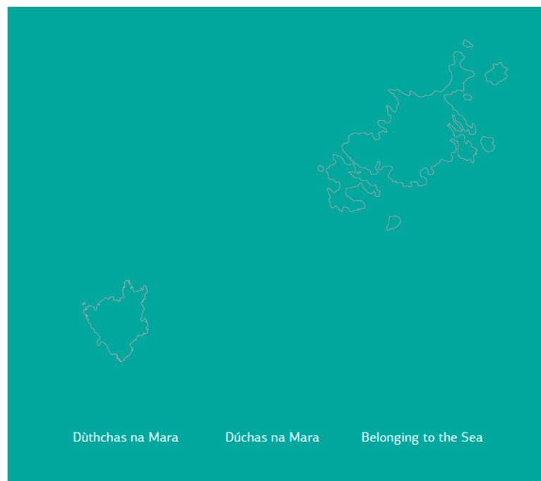
Figure 8. Belonging to the Sea (2012) cover map by Stephen Hurrell. e-book. Image used with permission from the artist.