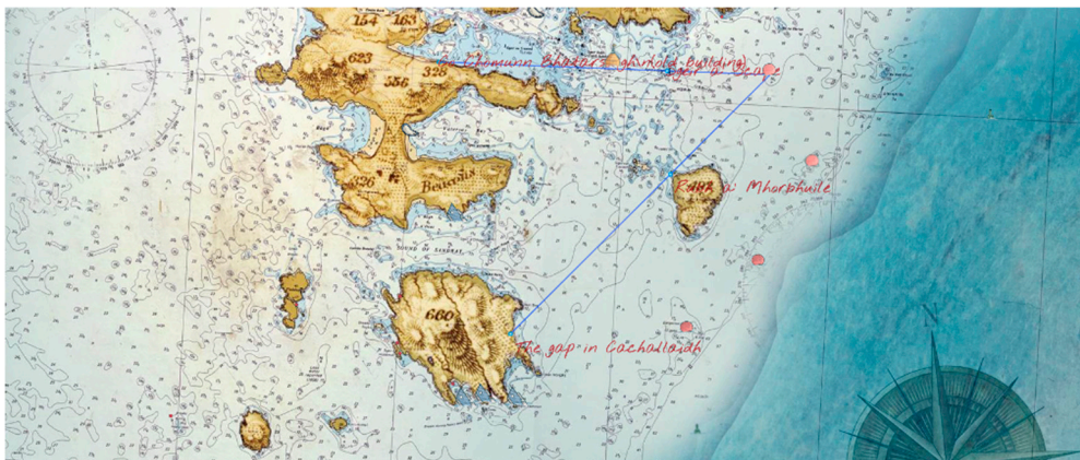
Figure 11. Screenshot of the Cullen shipwreck story in Sea Stories website.