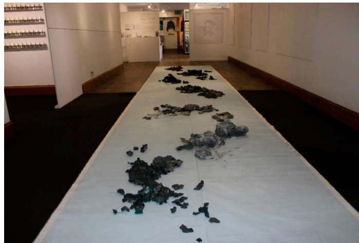
Figure 5. Archipelago . Exhibition overview.