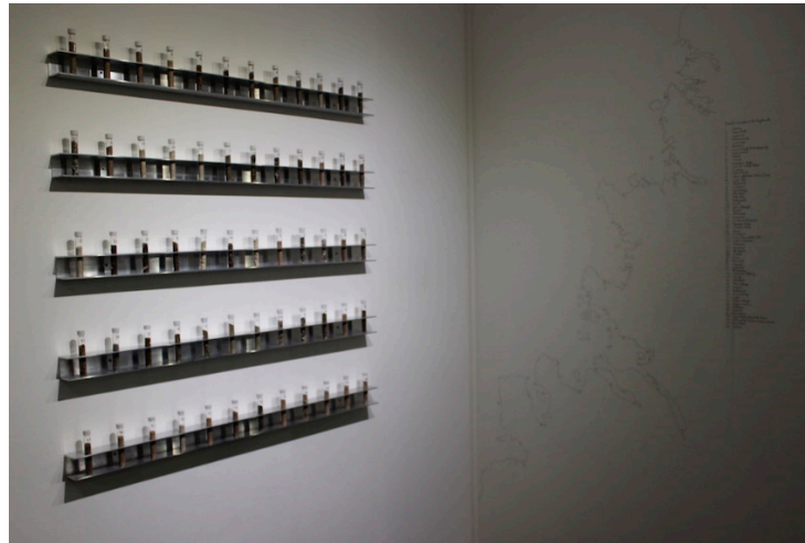
Figure 6. Sample, installation at Neo Terra exhibition, An Talla Solais, Ullapool. 13 May–18 June 2017.

(Brown et al. 2016). Thus, each sample spoke not only of its location but also of the wider implications of global marine pollution. 6 In an interview with the artist (18 June 2017), Barton mentioned that she had been contacted via social media during the exhibition by a Canadian scientist who was very interested in the collected sand samples which potentially highlight the extent to which sea-sand travels, as each grain of sand carries within it a trace of its source. 7 The extent to which both sand and plastic travels has only begun to be better understood in the last two decades (Tweedie 2018). 8