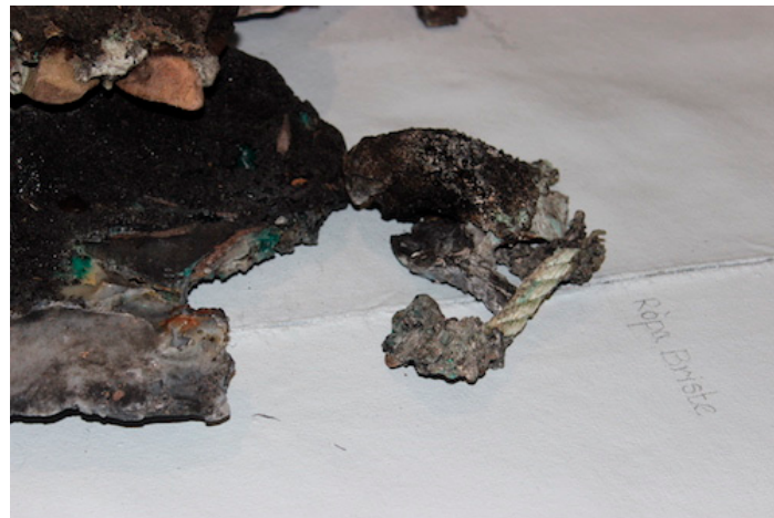
Figure 4. Archipelago : detail.