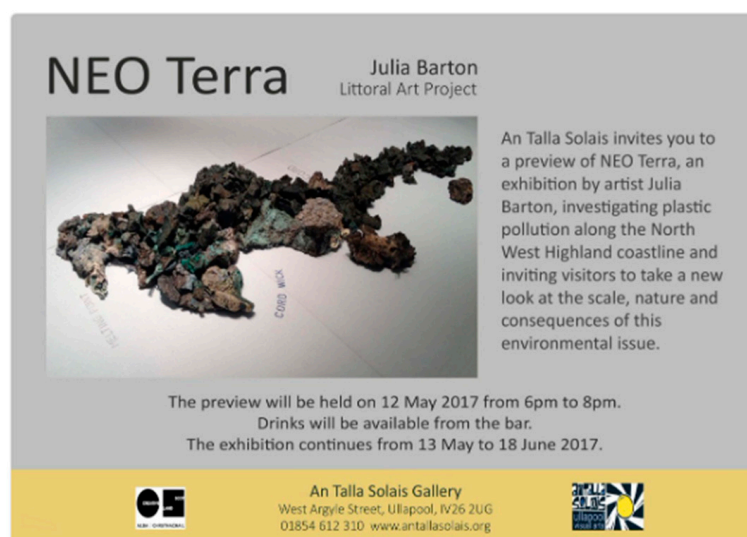
Figure 1. Neo Terra exhibition invite. An Talla Solais, Ullapool. 13 May–18 June 2017. Photograph created by the author.

For Rebecca Solnit, the seashore is an edge, 'perhaps the only true edge in the world where borders are otherwise mostly political fictions' (Solnit 2007, p. 254). The seashore is perpetually in flux, defined by a travelling body of water. This littoral edge forms the focus of Julia Barton's Neo Terra (2016) exhibition that interrogates the Anthropocene through her engagement with coastal marine plastic pollution on the North-West coast of Scotland: from Ross and Cromarty to the North of Shetland. These remote beaches, synonymous with an image of Scotland as a tourism destination, are not fundamentally remote but intrinsically connected to the global ocean systems. By examining the impact of plastic waste in the Anthropocene, Julia Barton's Neo Terra (2016) invites 'visitors to take a new look at the scale, nature and consequences of this environmental issue'. 2 Two artworks from this exhibition, Archipelago and Sample , are discussed as encountered during the author's field trip to the Neo Terra exhibition at An Talla Solais, in Ullapool in June 2017 (Figure 1). 3