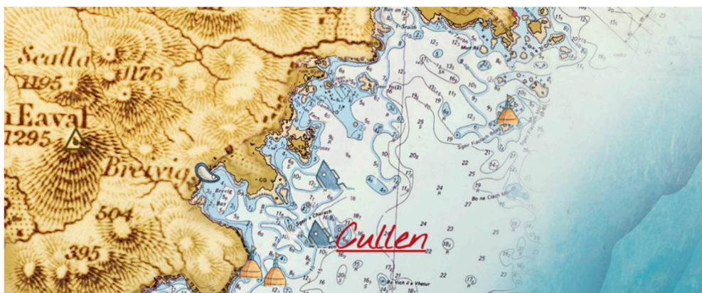
Figure 12. Screenshot of the Cullen shipwreck story in Sea Stories website. Reproduced with permission of the artist. Image used with permission form the artist.

Mapping the Sea: Barra (2013), as commissioned by Cape Farewell as part of Sea Change , was thus the culmination of an extensive period of mapping some of the cultural ecosystems of the Isle of Barra. 24 This nine-minute split screen film interweaves the recitation of place names by fisherman Calum a'Chal, with images from the sea (Figure 13). The film begins with large steel letters placed on the beach and the following quote, before it cuts to Calum reciting from memory, place names from around the Barra coast: 'As technological civilization diminishes the biotic diversity of the earth, language itself is diminished (David Abram, The Spell of the Sensuous )'. The interspersing images show individual fishermen working closely with the sea, along with images of an industrial seafood processing factory, 'suggesting a less direct engagement with the marine environment' (Hurrell 2018).