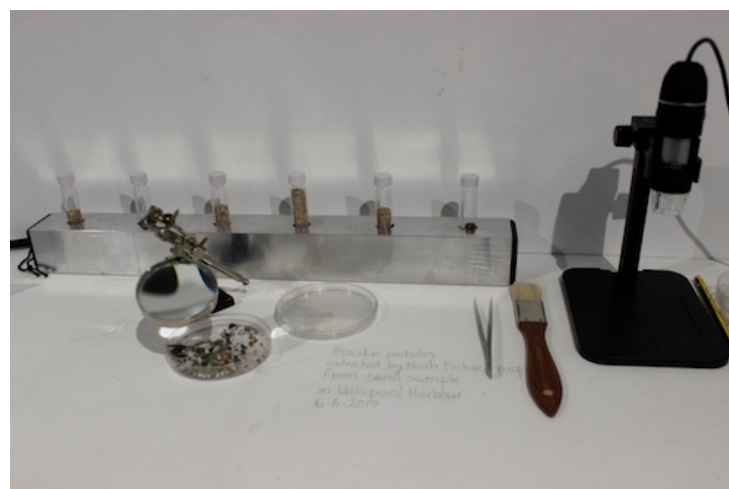
Figure 7. Interactive Lab at Neo Terra exhibition, An Talla Solais, Ullapool. 13 May–18 June 2017.