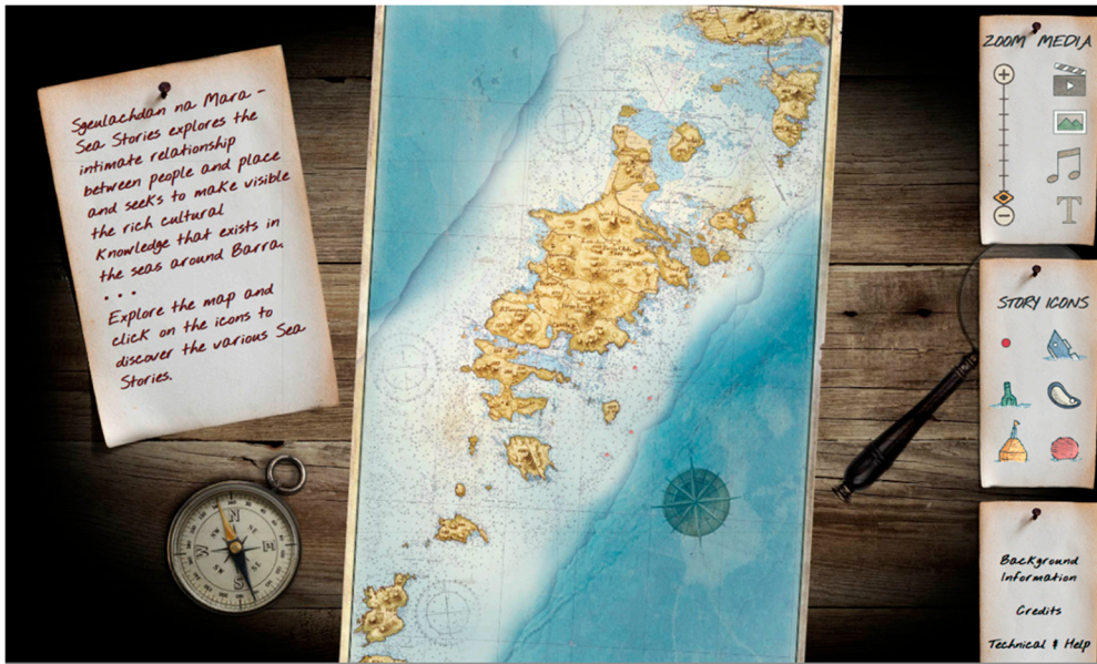
Figure 10. Screenshot of Bogha a Chlèirich. Sea Stories website. 23 Image used with permission from the artist.