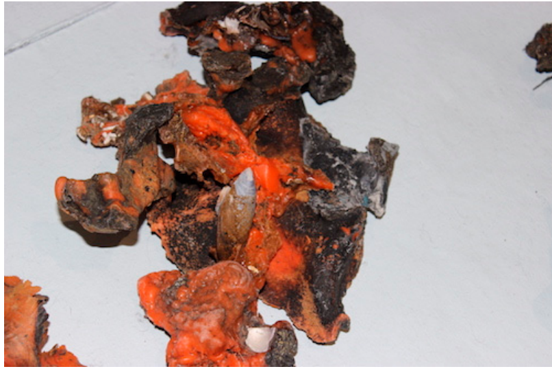
Figure 2. Plastiglomerate with embedded mussel shell. Neo Terra exhibition, Ullapool (2016).

Archipelago , the centrepiece of the Neo Terra exhibition, was a largescale floor-based map featuring 'islands' composed of plastiglomerates (Figures 3–5). Plastic is burnt, mostly by the fishing industry in Scotland, offshore or onshore, as a means of managing plastic debris. These plastic forms ultimately resemble rock formations, but that appearance belies a very different texture and weight. These lightweight forms were laid out by Barton on a large canvas map with co-ordinates and names written in pencil. The naming of the islands was informed by discussions with school children.