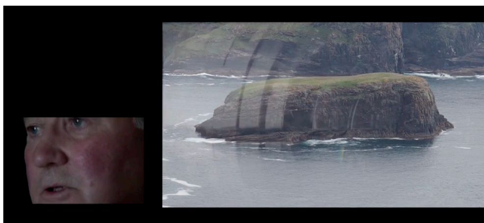
Figure 13. Screenshot Mapping the Sea: Barra (2013), Stephen Hurrell, commissioned by Cape Farewell. Image used with permission form the artist.

These mapping projects by Hurrell and Brennan can thus too be viewed as Littoral Art, operating between discourses of science and art, art and policy. Theirs too speaks of a profound enmeshment of cultural ecosystems with other ecologies.