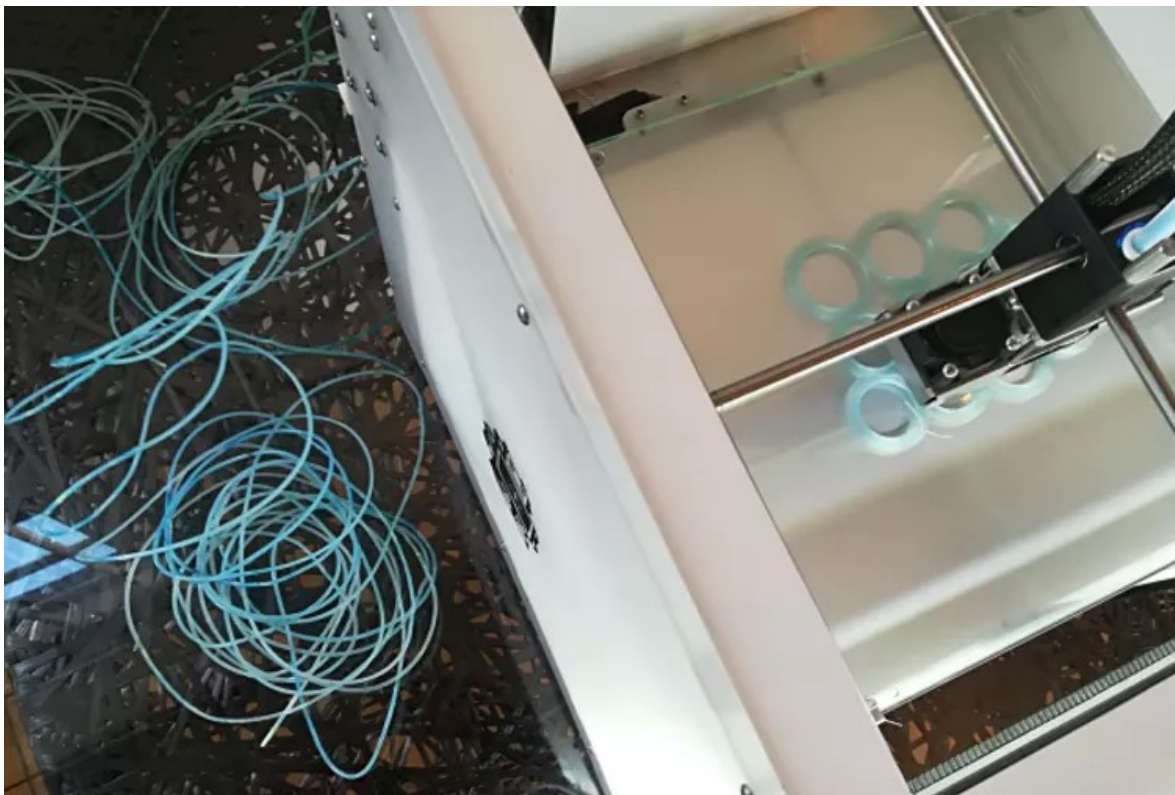
Ocean plastic, turned into filament for use in a 3D printer.

For example, polypropylene (PP) can be easily ground down and shaped, but has to be mixed 50:50 with polylactide (PLA) to maintain the consistency the printer requires. Mixing types of plastics like this is a step backwards, in the sense that they become more difficult to recycle, but as an investigation into new potential uses for the material, what we've learned might allow us to take two steps forward in the future. Other ocean plastics such as polyethylene terephthalate (PET) and high-density polyethelene (HDPE) are also suitable.