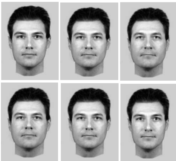
Fig. 4. An example of the ageing (top row) and pleasantness (bottom row) holistic scales. Manipulations increase in magnitude from left-to-right and are illustrated on an EvoFIT of TV celebrity, Simon Cowell.

Following development of these age-constrained databases, users still sometimes evolved faces with inaccurate ages, though to a lesser extent than before. We sought to overcome the problem by providing a sliding scale for adjusting composites' perceived age, and extended this facility to allow adjustment of other whole-face properties. These so-called holistic tools included face weight, masculinity, threatening, attractiveness, honesty and extroversion. See Fig. 4 for examples, and Frowd, Bruce, McIntyre, Ross and Hancock (2006a) for a description of how the scales were designed. Further scales were developed to add stubble, eye-bags and deep-set eyes, and to alter the greyscale levels of brows, irises, mouth creases, etc. These holistic tools are used at the end of evolving, after external feature blurring is turned off.