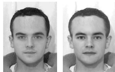
Fig. 2. EvoFIT Images produced of TV presenter, Anthony (Ant) McPartlin. The same person used the system twice to evolve a composite of his face from memory, producing a consistent likeness.

An evaluation of this version of the software was carried out. Fifty laboratory-witnesses saw a photograph of a footballer whose face was unfamiliar to them, and two days later described the face (using a CI) and constructed a composite with EvoFIT or a traditional feature system. The resulting images were then given to football fans to name. Among witnesses who attempted to remember the face in detail, EvoFITs were correctly named at 11% and feature composites at 4% (Frowd et al., 2007b). In subsequent research (Frowd, Bruce, Plenderleith & Hancock, 2006b), we asked the same person to use the system more than once to construct a likeness of the same target face. There was good consistency of results, as Fig. 2 illustrates. When used in this way, the faces the user sees at the start change for each attempt—they are different random faces—and so the search process is also somewhat different each time, as is the resulting image.