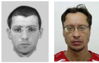
Fig. 7. The left image is an EvoFIT produced by a 10 year old victim of robbery; the right image is a recent photograph of the person convicted.

The composite was released to local police forces. After a month, police detained a person with notable similarities to the composite. The man was later convicted and sentenced to 7 years in prison.