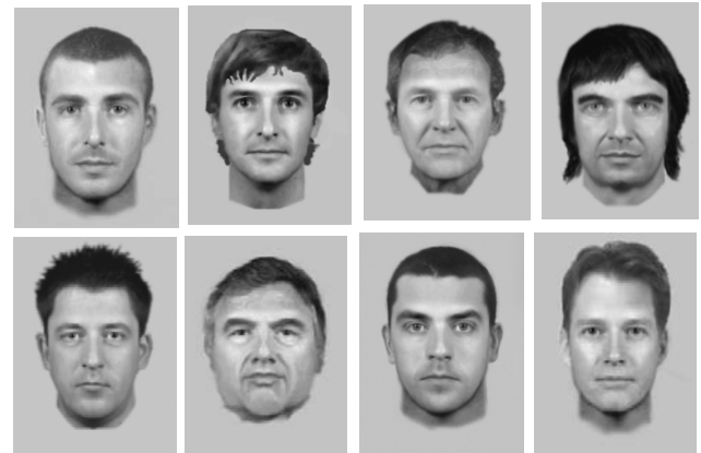
Fig. 5. EvoFITs made from memory. From left to right (top row), they are of footballer, David Beckham; actor, David Tennant; former US president, George W. Bush; singer, Noel Gallagher; and (bottom row) footballer, John Terry; singer, UK politician, Gordon Brown; singer, Robbie Williams; and UK politician, Nick Clegg.

Example celebrity EvoFITs constructed from memory using this version of EvoFIT are illustrated in Fig. 5.