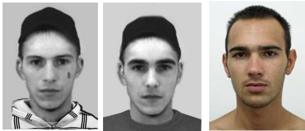
Fig. 8. These EvoFITs (left and centre) of a bicycle thief were constructed by separate witnesses over a period of two months. On the right is a photograph of the person believed to be responsible for committing these crimes.

Shimano bike thief: EvoFIT also proved valuable for detecting a fairly-prolific bike thief. This involved four thefts of bicycles between May and August 2009, with the thief cutting safety locks. Two EvoFITs were constructed by eyewitnesses at Iasi Police Headquarters, leading to the arrest of the person shown in Fig. 8.