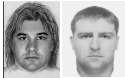
Fig. 1. The EvoFIT (left) and person (right) convicted in the 'Beast of Bozeat' case. Shortly after the crime, the perpetrator is believed to have changed his hairstyle in an attempt to conceal identity, as illustrated here.

together in combination (each possible facial shape shown with each possible facial texture) for identifying the best likeness.