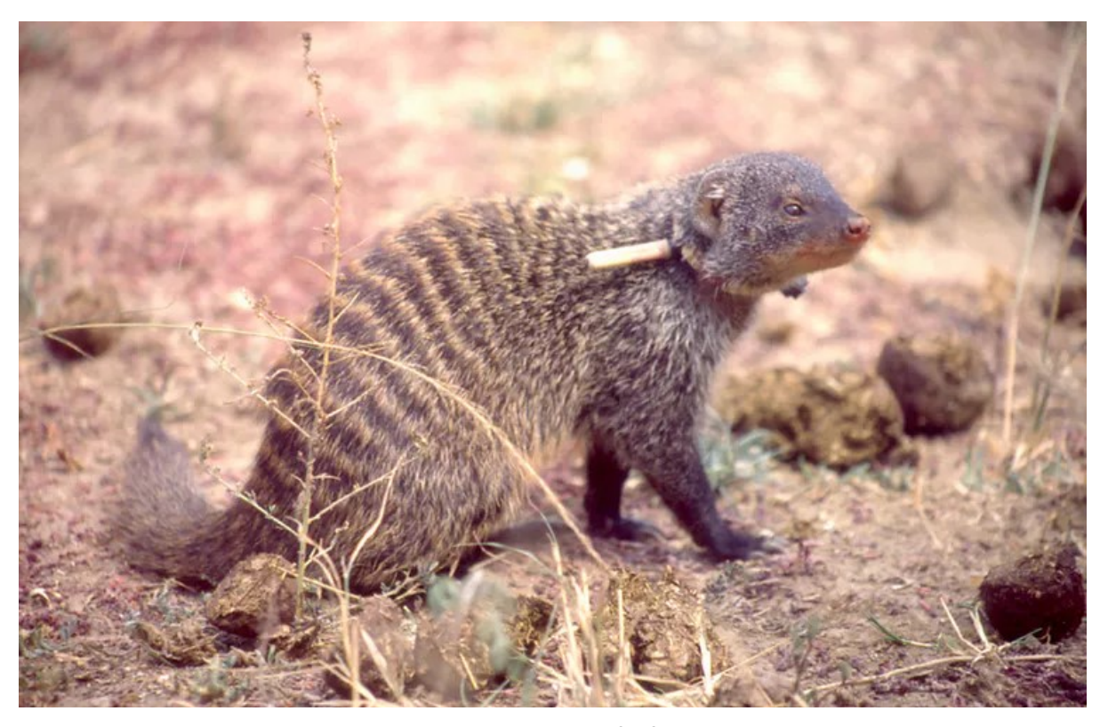
Banded mongoose watching the world go by. It's not all angst in the life of a mongoose – they also get to chill.

imagined that these same mongooses would continue to be monitored by researchers over the subsequent two decades.