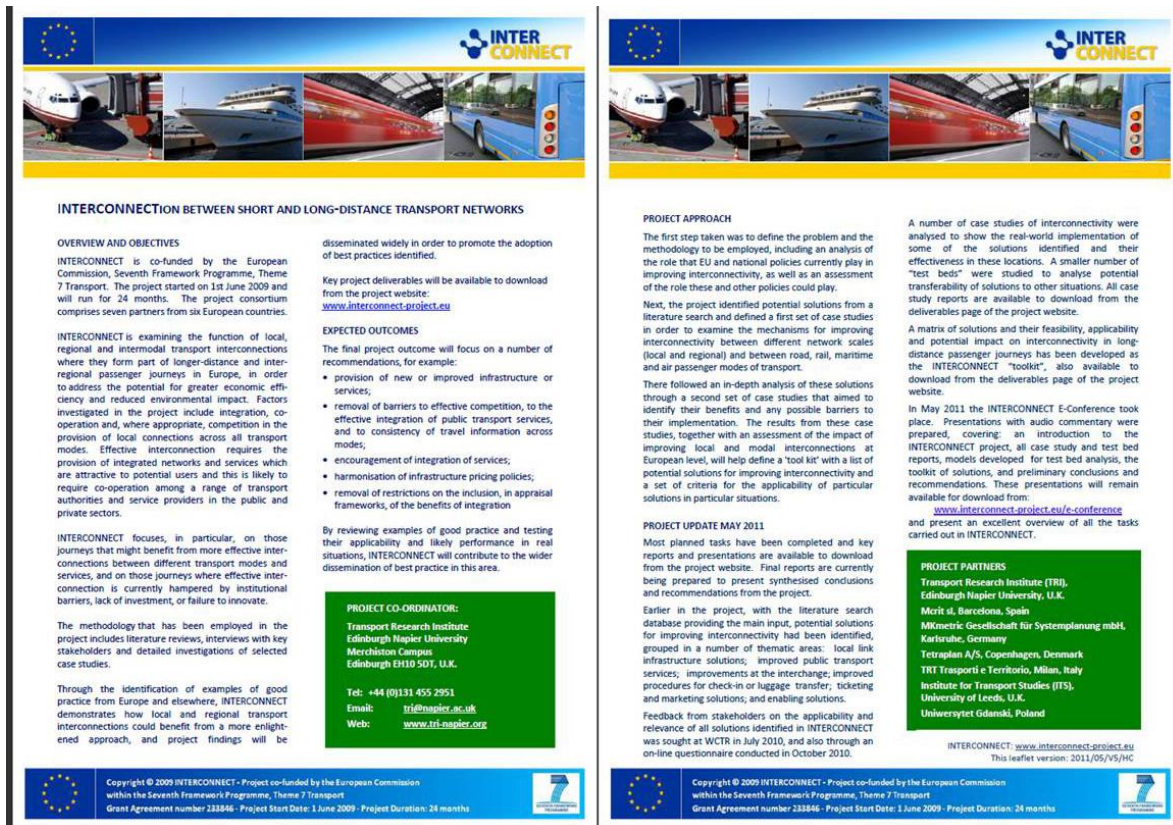
Figure 3-2 INTERCONNECT project presentation leaflet