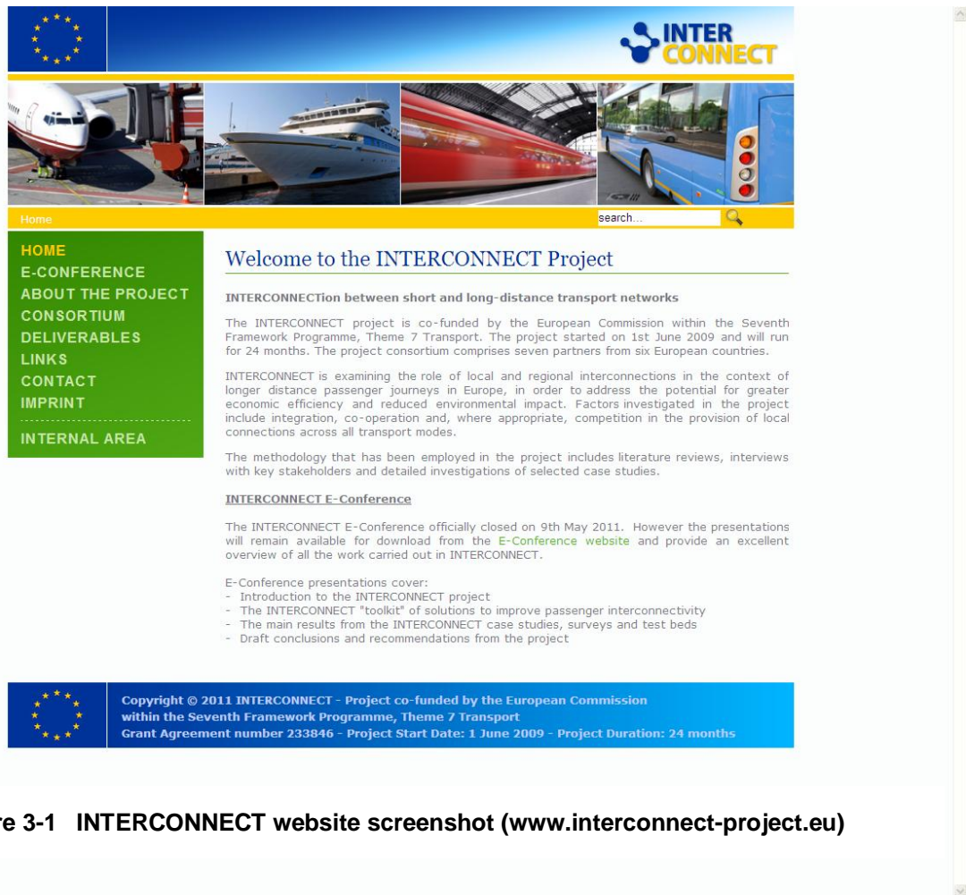
Figure 3-1 INTERCONNECT website screenshot (www.interconnect-project.eu)