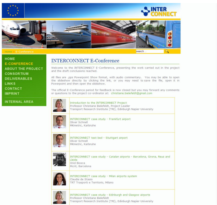
Figure 3-3 INTERCONNECT E-Conference screenshot (www.interconnect-project.eu)

Stakeholders could have downloaded PowerPoint presentations with audio commentary until 9th of May 2011. During this period they were able to send comments and questions regarding these presentations to the consortium. Afterwards, members of the consortium discussed and responded directly to all feedback received. In all the E-Conference had approximately 100 external hits from 2nd to 9th May 2011, which illustrates the number of visitors to the E-conference. The presentations will stay online and available to download on the project website for at least one year beyond the end of the project as they are part of the main results of INTERCONNECT.