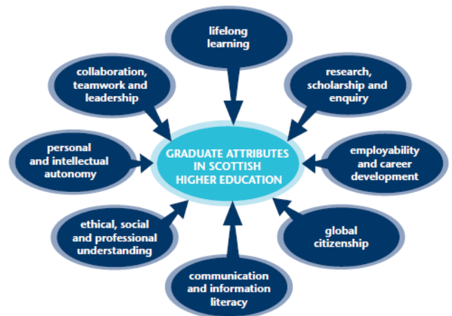
Figure 1: Scottish GGAs [3]

delivering employable graduates. Nowhere is this more clearly exemplified than in Scotland where the Quality Assurance Agency for Higher Education, Scotland (QAAS) maintains a rolling program of work whose aim is the enhancement of the student learning experience in Scotland. Through a series of “enhancement themes” Scottish universities contribute to reflective and developmental projects, the most recent of which, entitled “Graduates for the 21 st Century” (G21C) ran between 2008 and 2011. A concluding summary of the G21C theme makes specific reference to need to allow HE institutions and subject disciplines to fine-tune the outputs and approaches [3], and the set of GGA identified during the theme – shown in Figure 1 – is therefore necessarily couched in general terms. The final framework based as it is on current existing practice demonstrates a balance between the managerial need for articulation of goals and the complex nature of the area.