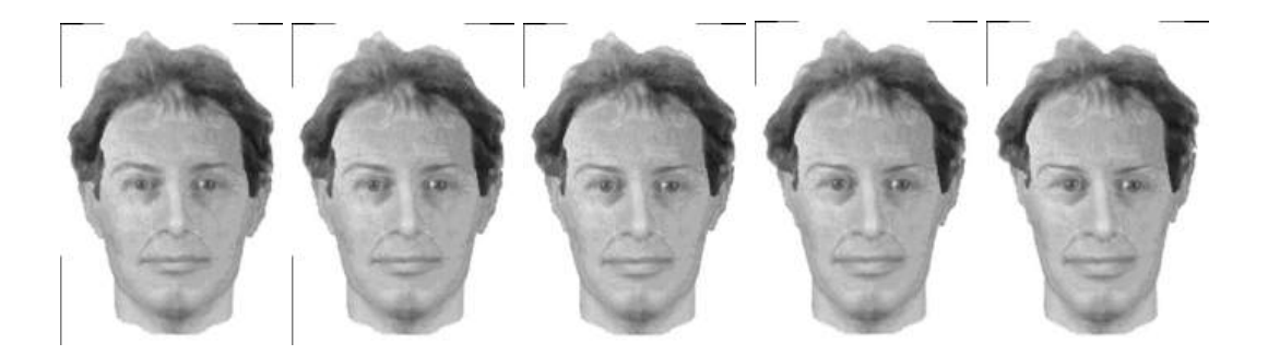
Figure 2. Different levels of caricature applied to a composite of former UK Prime Minister, Tony Blair. From left to right, exaggerations are at -30%, -15%, 0% (veridical), +15% and +30% caricature. Negative percentages represent anti-caricatures, zero (0%) the veridical composite, and positive percentages are positive caricatures.