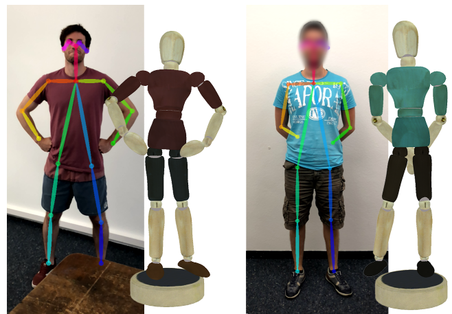
Figure 4: The user’s initial pose and the representative color of their clothes are applied to the virtual character of the game.

As soon as the user has defined a location and the real-world assets for the gaming experience, we start travelling across the RVC. We use a predefined 3D printed object to incorporate a narrator into the game (as shown in Fig. 3). We use Props Alive [Casas et al., 2017] to create the illusion of movement of static objects from the real world with photo-realistic renderings. Additionally, when these animated real-world objects cast shadows, we use Shadow Retargeting [Casas et al., 2018] to account for their deformation. Hence, our application enhances the user’s imagination by presenting extended capabilities, such as speech and movement, to inanimate objects in the real world.